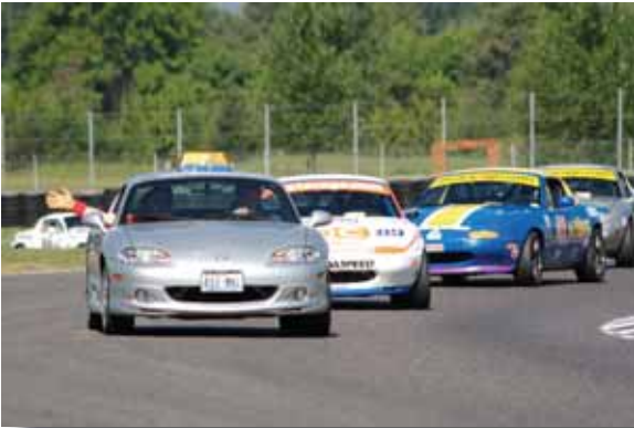
Pace lap for the exciting Spec Miata race.