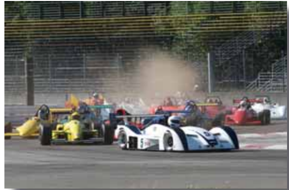
Dust up in the Festival Curves