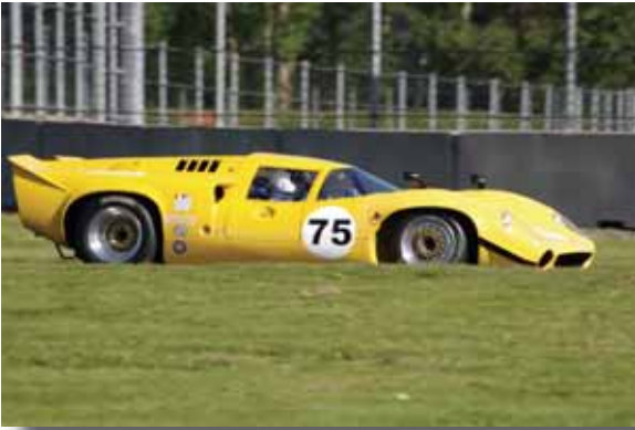
Vintage Lola at speed.