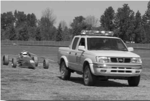
Sometimes we need help getting home.