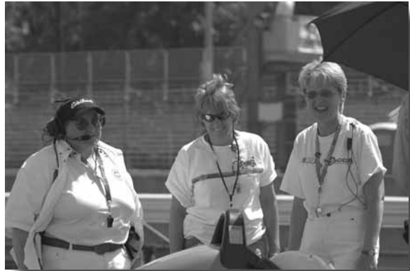
Good times on pre-grid.