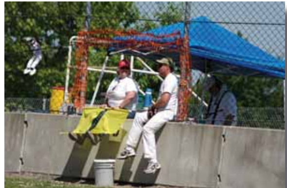
Break time between track sessions.